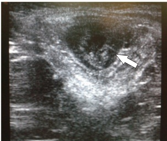
Figure 2. Ultrasonographic view of the puborectalis muscle (arrow)

identified (Figure 2). The anal sphincter complex appears on ultrasonography as a hypoechoic ring shadow. The puborectalis appears as a 'V' shaped mixed echogenic shadow encircling the sphincters. With sonographic guidance a 26g needle was introduced in to the puborectalis sling and 50 units of botulinum toxin was injected in to each limb of the puborectalis sling under sonographic guidance. Although the needle cannot be visualized sonographically the movement of muscle fibres with the penetration of the needle is used as a guide. Post operatively the patient was managed with oral analgesia and syrup lactulose 30 ml nocte. She was advised to have a fibre rich diet and adequate amount of water. Using of a squatting pan for the act of defecation was recommended as the pelvic floor muscles are maximally relaxed in this position. Patient was discharged on post procedure day one and reviewed at post procedure two weeks. Patient had dramatic improvement of symptoms with biofeedback, two weeks after the procedure. On further follow up her symptoms reappeared at 1 month following the procedure. Injection of botulinum toxin was done for the second time in the same manner.