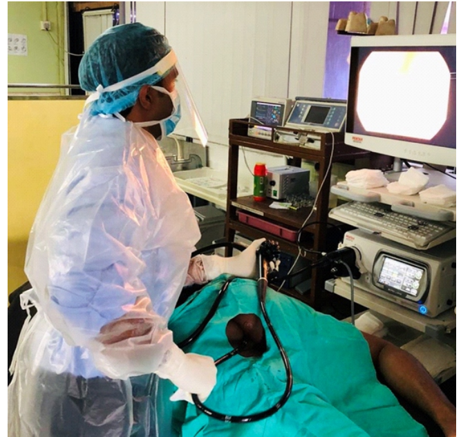
Figure 2. Performing colonoscopy on a patient with suspected exacerbation of ulcerative colitis by a surgeon in PPE.

With the closure of Universities undergraduate academic activities were completely disrupted. As a university unit we had the responsibility to continue both undergraduate and post graduate education activities. As an experimental effort we organized an online discussion forum on Zoom involving the medical students, postgraduate trainees and consultants. A discussion session was organized every week day night with the participation of around 300 participants. The breath of the discussions spanned from surgical anatomy to operative surgery, which enabled both undergraduates and postgraduates to participate. Social media platforms were used to communicate amongst the group and to upload recorded sessions for later reference.