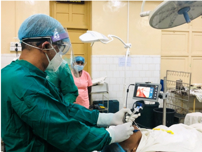
Figure 1. intubation of a patient for extended right hemi colectomy by an anaesthetist in PPE, using a video laryngoscope to minimize the risk of disease transmission.

meetings were as effective as usual. One added advantage was that the participation of the trainees was much higher as the online platform enabled them to participate while they were at their duty stations. It was both effective and efficient.