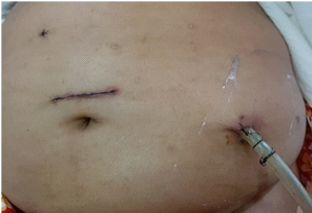
Figure 3. Port sites and incision for specimen retrieval.

Postoperatively patient received ICU care for one day and was discharged from the ward on postoperative day 6. She had an eventful recovery. The drain amylase was 5020 IU/L on day one which was reduced to 200 IU /L by day three. The histopathology revealed a mucinous cystic neoplasm of the pancreatic body with clear resection margins.